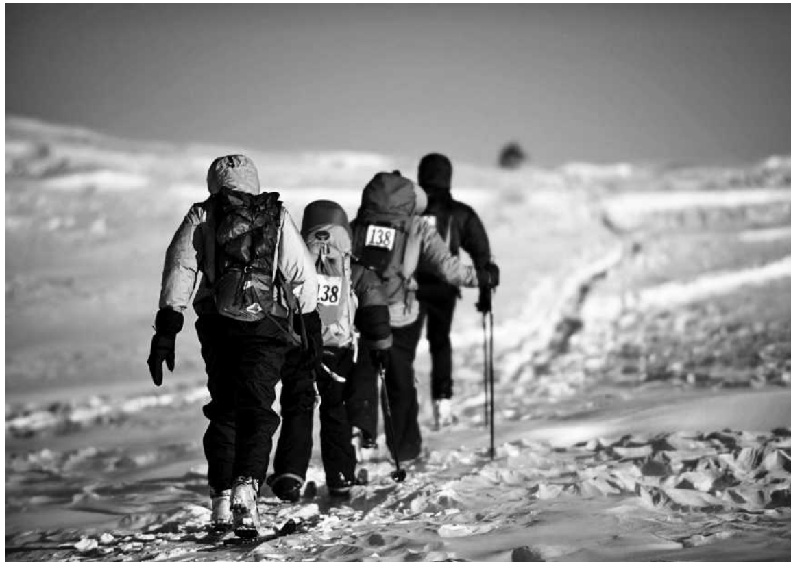
The wind-swept scene from near Taylor Pass.