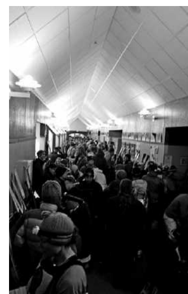
The madness of final check in, a few minutes till midnight.